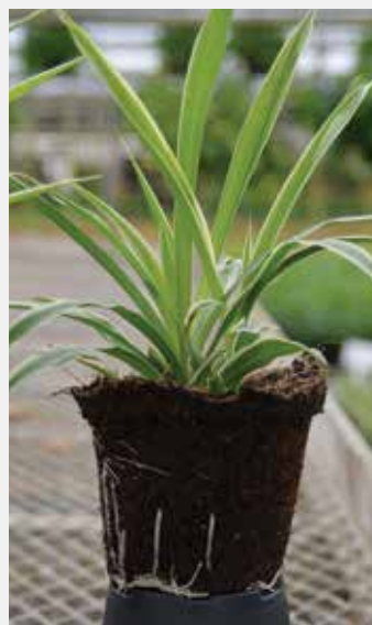
SPIDER PLANT PRODUCTION